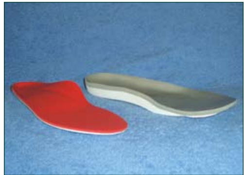
Figure 2. Left: prefabricated functional insole (Interpod Diabetic insole; Algeo Ltd). Right: Custom-made total-contact insole.

Fitted to foot size, the Interpod Diabetic insole (Algeos Ltd) consisted of a prefabricated full-length polyurethane contoured shell covered in 3 mm poron 96. The device incorporated a six-degree bi-planar medial rearfoot skive and plantar fascia groove (Figure 2).