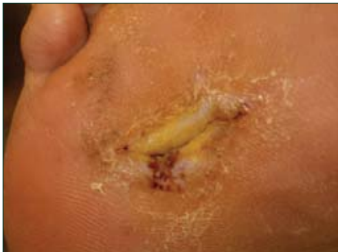
Figure 5. Resolution of ulcer with use of the prefabricated functional insole.