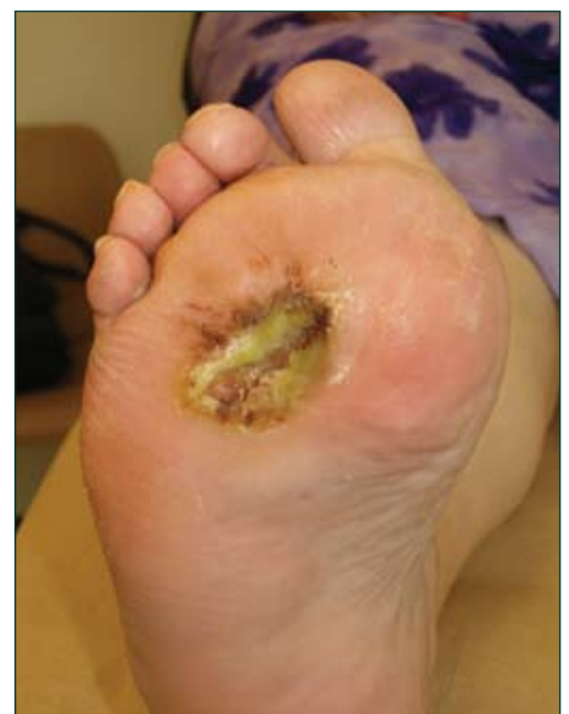
Figure 1. Ulceration with use of custom-made total-contact insole.

Produced from a semi-weight bearing foam box foot impression, the custom total contact insole comprised a full-length medium EVA